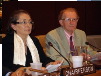
New York 2008, May 13

PARTNERSHIPS FOR SUSTAINABLE DEVELOPMENT